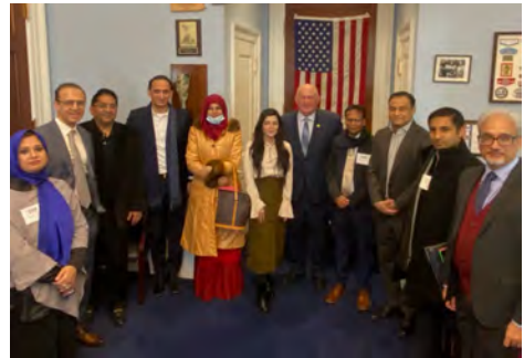
PAKPAC members and Congressman Glenn Thompson (R-PA) at his Capitol hill office

We extend our deepest appreciation to our community for their hard work and dedication and were ecstatic with how many members of Congress signed onto the resolution as a result of these efforts in January.