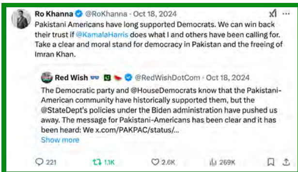
Congressman Ro Khanna (D-CA) made pertinent remarks on PAKPAC's endorsement of President Donald Trump.