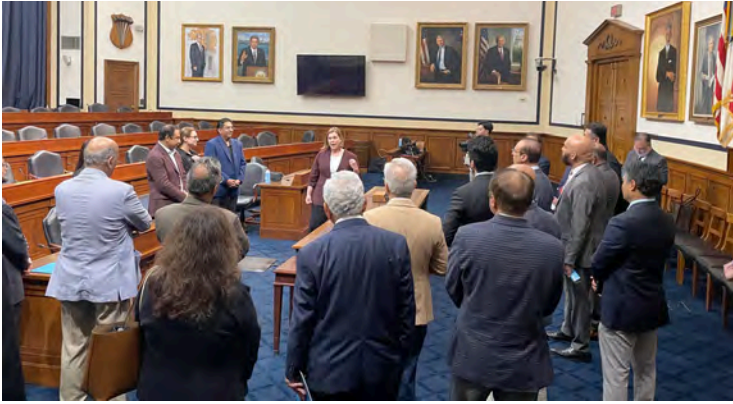
Then-Congresswoman (now Senator) Elissa Slotkin (D-MI) speaking with attendees at the House US-Pakistan caucus reception in the House Armed Services committee hearing room.