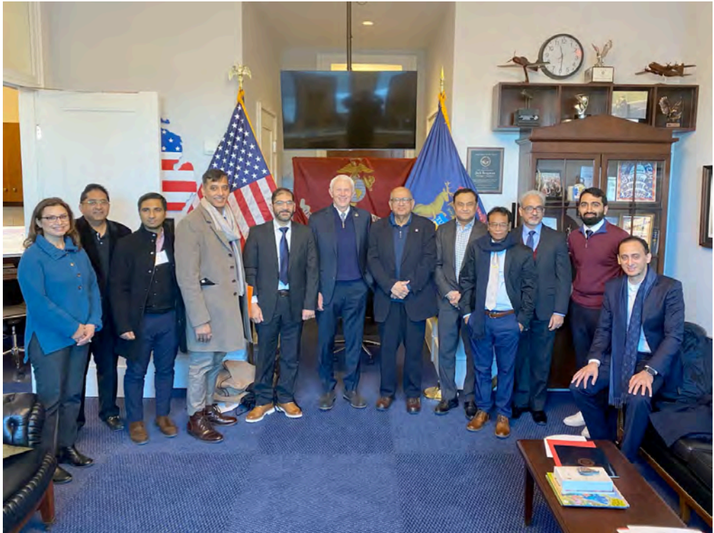
PAKPAC members and Chair of the Congressional Pakistan Caucus Congressman Jack Bergman (R-MI) at his office in Washington, D.C.