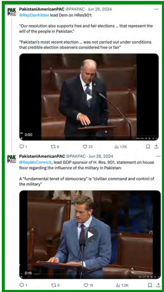
Quotes from the floor speeches of the bills sponsors Congressman Dan Kildee (D-MI) and Congressman Rich McCormick (R-GA)