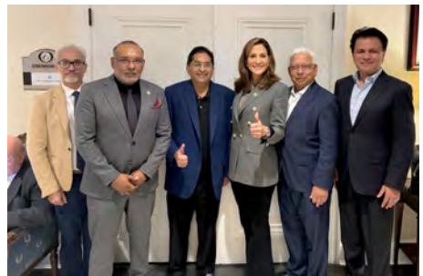
PAKPAC Members with House Foreign Affairs Committee member Congresswoman Maria Elvira Salazar (R-FL). PAKPAC rapidly establish a now blossoming friendship with the Congresswoman in the lead up to the House Foreign Affairs Committee vote