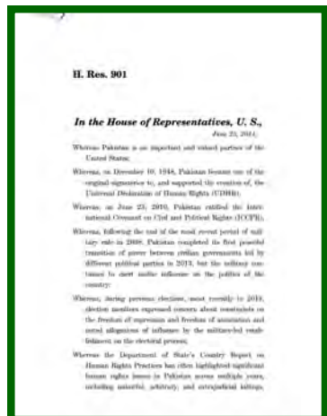
Page 1 of H.Res. 901 – Congress's first major piece of Pakistan legislation in decades .