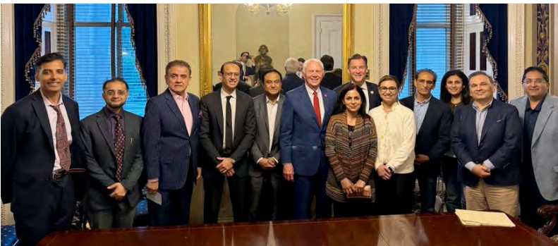
PAKPAC National Board members with Chairs of the US-Pakistan Congressional caucus: Rep. Jack Bergman (R-MI) and Co-Chair Rep. Suozzi (D-NY).