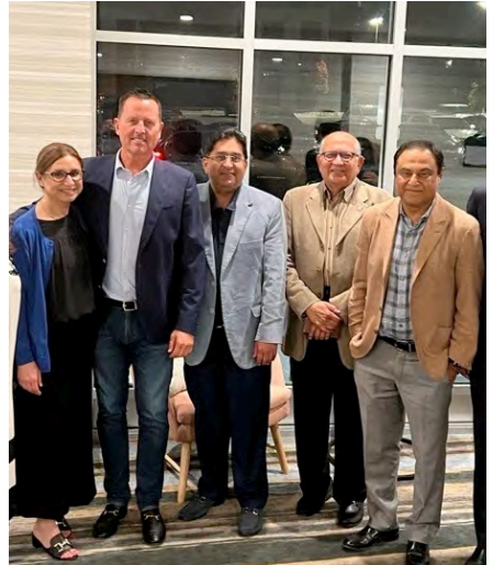
PAKPAC National Board members with Presidential Envoy for Special Missions Richard Grenell.