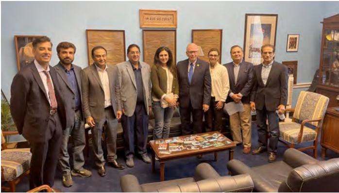
PAKPAC community leaders with Congressman Tim Walberg (R-MI).